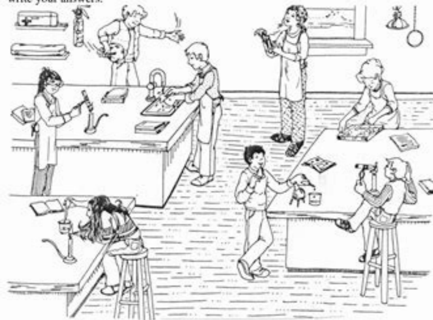
Created or selected by Chris Neumann

Find 15 things wrong with these pictures. Place a number next to a student or lab equipment and then write a brief explanation of what the student was doing wrong. Use the back of this page to write your answers.